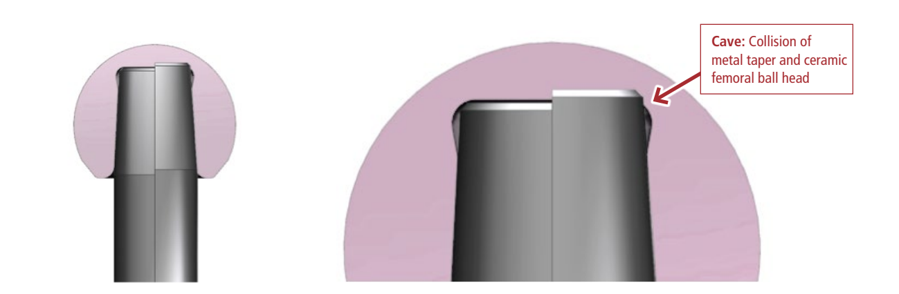
Fig. 4: Compatibility example: Design difference between two nominally similar 12/14 tapers demonstrated with the fit with a ceramic femoral ball head